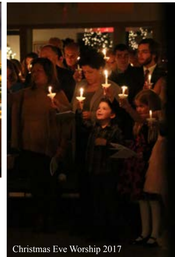
Christmas Eve Worship 2017

Vacation Bible School - For 3 year olds (as of 1-1-18 and potty trained) to rising 5th graders. July 23-27 9am-12:00 Registration coming soon!